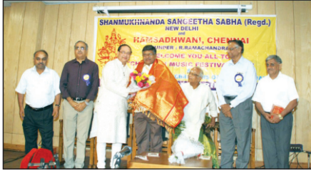
Ravi Shankar Prasad, Hon'ble Union Minister for Law and Justice & IT felicitated by Mohan Parasaran, President of the Sabha