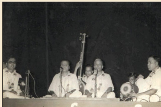
Alathur Brothers (Srinivasa Iyer & Sivasubramania Iyer) with Lalgudi G. Jayaraman on Violin and Palani M. Subramaniam Pillai on Mridangam